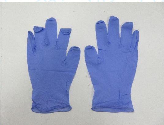
Samples described as 2.2mil (2.7g-3.1g) Powder Free Nitrile Examination [Purple blue]

A handwritten signature in black ink, appearing to be 'J. H. J.', written over a horizontal line.