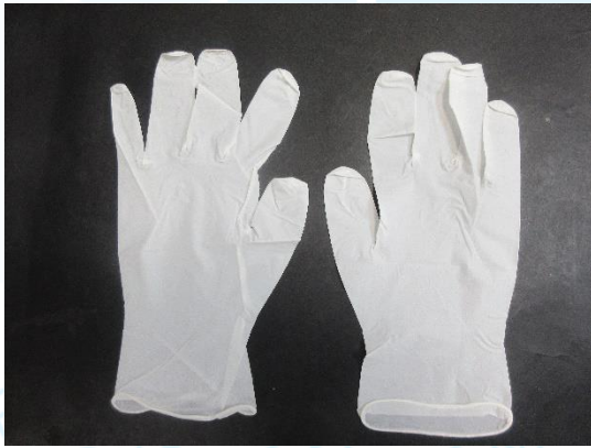
Samples described as 2.2mil (2.7g-3.1g) Powder Free Nitrile Examination [White]