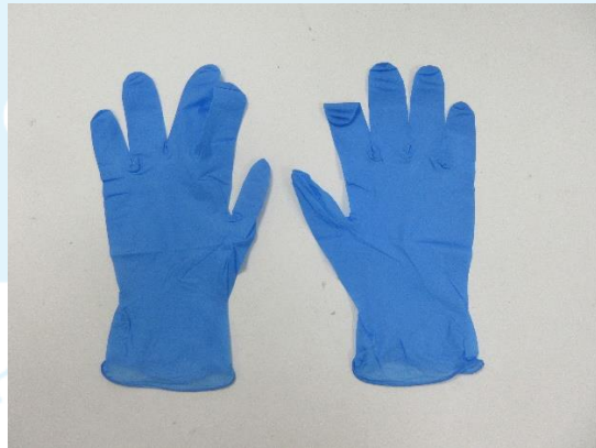
Samples described as 2.2mil (2.7g-3.1g) Powder Free Nitrile Examination [Regular blue]